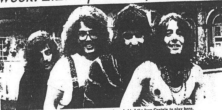
Locomotive GT is the first rock group from behind the Iron Curtain to play here.

Lead singer Geddy Lee has a high-pitched voice, not unlike Jimmy Page of Led Zeppelin. He had trouble with the mike and revealed later that he couldn't even hear his own voice. But the group had such energy and power that few noticed.