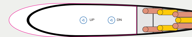
DECK 11: DORSAL