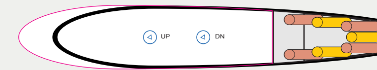
DECK 10: DORSAL