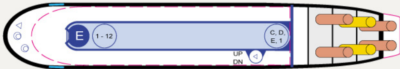
DECK 1: DORSAL