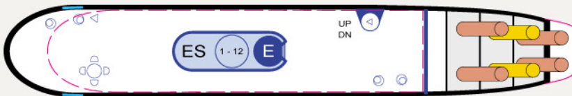
DECK 3: DORSAL