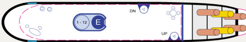
DECK 2: DORSAL