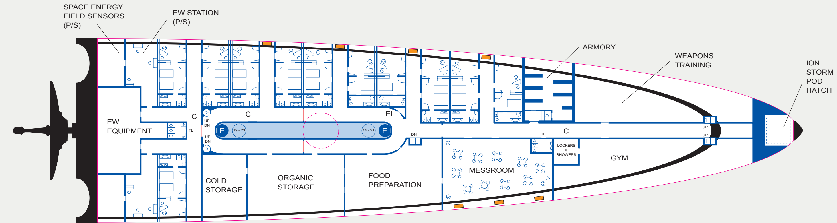
DECK 20: CREW QUARTERS / FOOD PREPARATION

The entire aft end of the deck is set aside for oversized cargo. It can be loaded via the large hatches located on the underside of the Secondary Hull.