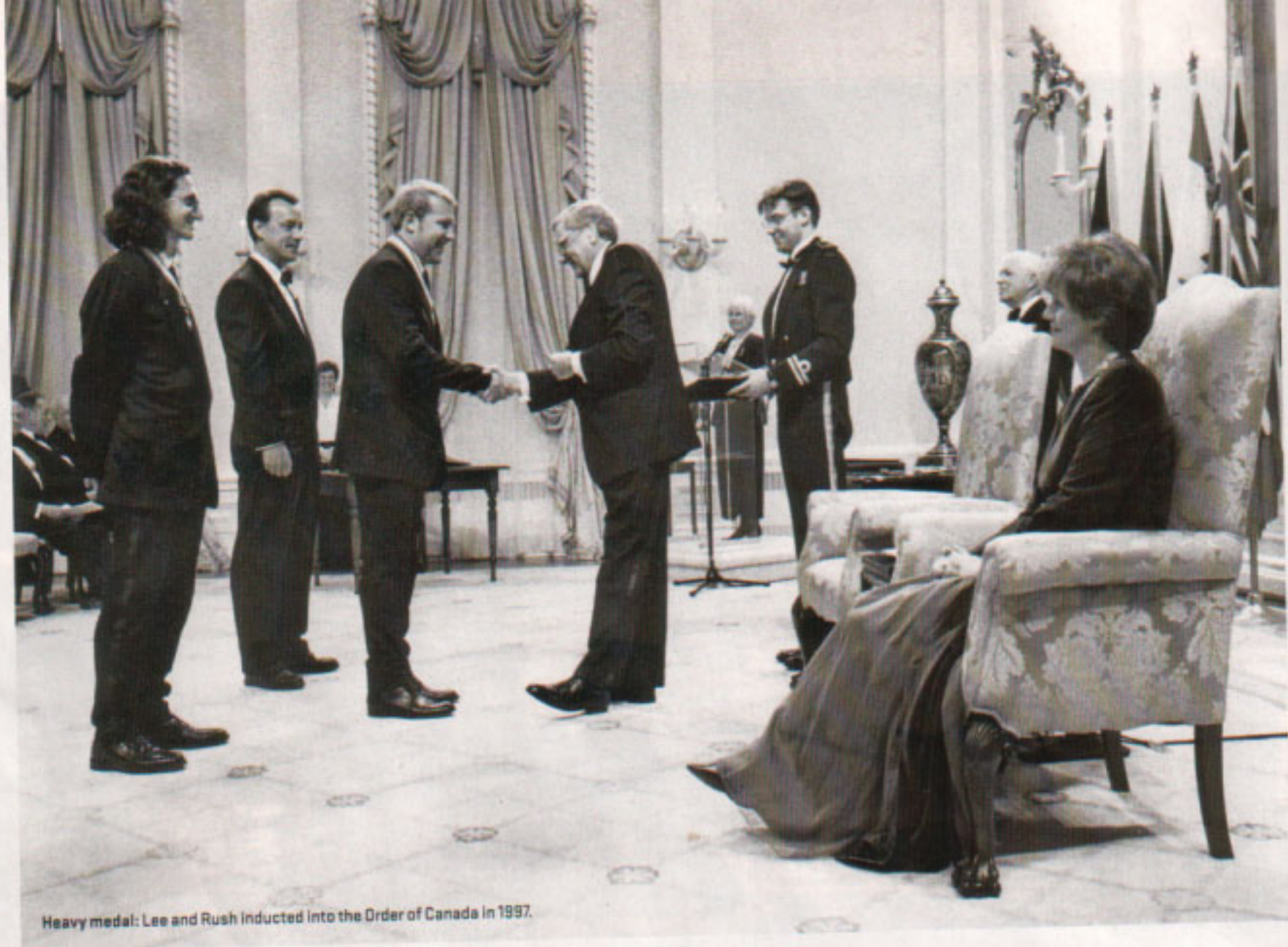
Heavy medal: Lee and Rush inducted into the Order of Canada in 1997.

high-pitched, scared-schoolgirl vocals, Peart's epically endless drum solos, the band's 20-minute science-fiction suites and their preeminent popularity among virgin males. More and more, cool culture has deemed Rush cool: Beastie Boys and Foo Fighters have declared their admiration, South Park gave a shout-out and the Mars Volta and Coheed and Cambria emulate Rush's twisting hard-rock concertos. In July, they played live on The Colbert Report , and long before the band had a walk-on as the heroes of the recent I Love You, Man , they were saluted in the B-movie Orgazmo : "Geddy Lee. Best bass player ever." Plenty of people believe that's true, and not all of them ice-skate to work and eat doughnuts for dinner.