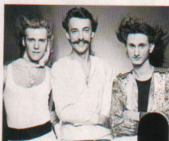
Clockwise from top: Lee shills for Subway's Five Dollar Footlongs; Rush in their short-lived career as male models, 1983; the band propping out on The Colbert Report last July.

feel secure. They're always waiting for those soldiers to come back.