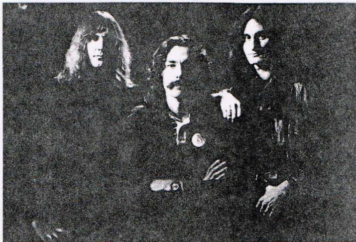
Rush: Alex Lifeson - Neil Peart - Geddy Lee

Lee feels Hemispheres is a continuation of a musical progression the group has been undergoing over the past few albums. "I kind of think that with 2112, we created a sound of our own, and with the last two (studio) albums, we've just been refining that sound. They're all just more definitive statements of the same sound. As for where we'll