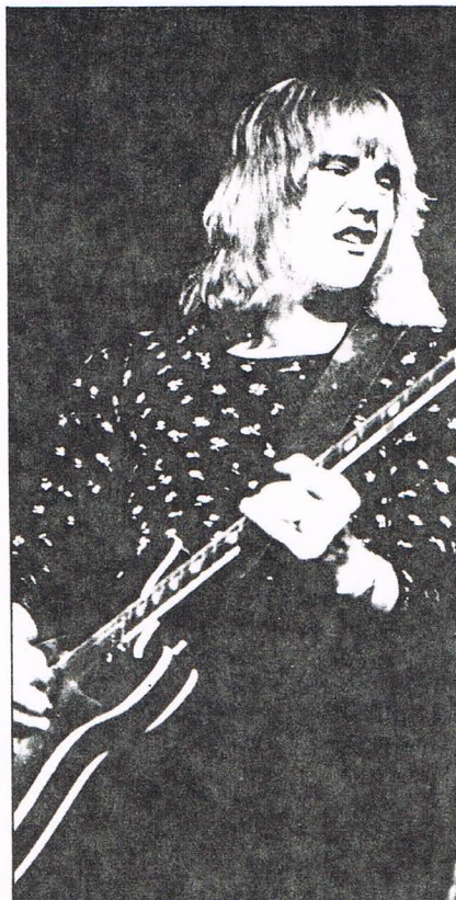
Alex Lifeson, guitar: "Our favorite Canadian band is ourselves."

"We don't want to change what people think about rock & roll," Alex states firmly. "We just want to show them what we think about it." And, oh yes, all the boys watch Star Trek, thrilling to the adventures of (Canadian-born) William Shatner and his Enterprising crew "whenever we're anywhere." ●