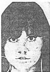
Linda Ronstadt appears at Kent State University May 11.

And there's more. "Collectively they create a patchwork of varied musical styles from bluegrass to rock, on a solid country background, stitched together with wit and showmanship."