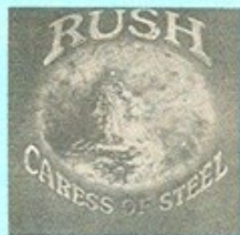
CARESS OF STEEL ANR-1-1003* AN8-1-1003* AN4-1-1003*