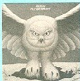
FLY BY NIGHT ANR-1-1002* AN8-1-1002* AN4-1-1002* (certified gold)