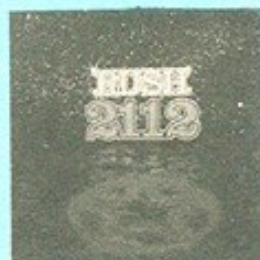
2112 ANR-1-1004* AN8-1-1004* AN4-1-1004* (certified gold)