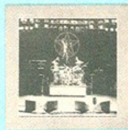
ALL THE WORLD'S A STAGE ANR-2-1005* AN8-2-1005* AN4-2-1005* (certified gold)