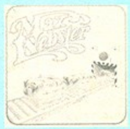
MAX WEBSTER ANR-1-1006* AN8-1-1006* AN4-1-1006