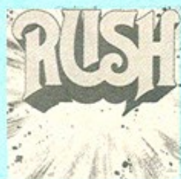
RUSH ANR-1-1001* AN8-1-1001* AN4-1-1001* (certified gold)